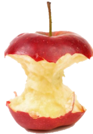
FOOD & LIQUIDS