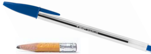
BROKEN PENCILS, DRY PENS