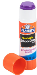
DRIED-UP GLUE STICKS