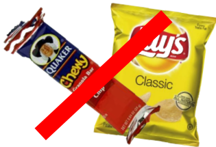
NO FOODS FROM HOME