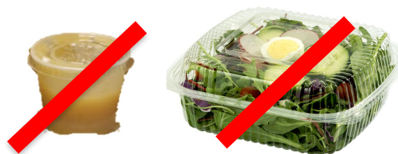
NO FOODS WITH REOPENABLE PACKAGING