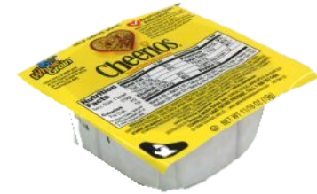
UNOPENED, FACTORY-SEALED FOODS