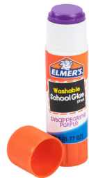
DRIED-UP GLUE STICKS