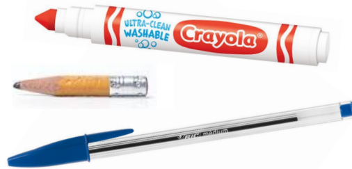
STUBBY PENCILS, DRY PENS & MARKERS