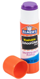
DRIED-UP GLUE STICKS