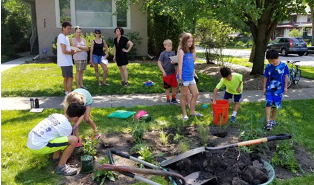
River Forest neighbors plant a pollinator garden during a Green Block Party this summer.

Deep Roots is also working with the Commission on the Parkways for Pollinators initiative. The organization helped put on a Green Block Party activity in River Forest earlier this summer, during which residents planted a permanent pollinator garden in the 700 block of Bonnie Brae.